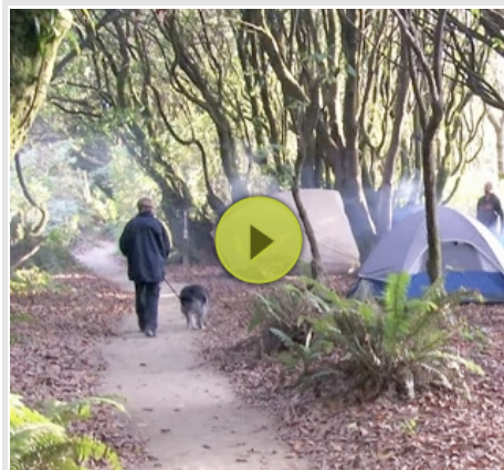
Camping around Sonoma County added June 22nd View All Videos